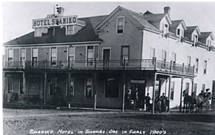
SHANIKO HOTEL IN SHANIKO, ORE IN EARLY 1900'S