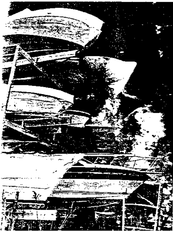
Stacked boats ablaze at height of Long Beach Maneland storage-yard fire