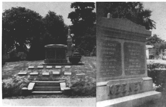
Greenwood Cemetery, Brooklyn, NY